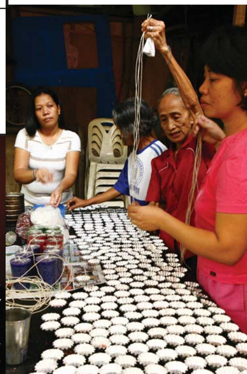
Urban Botanical Resident/ Beneficiaries of the SJBP Candle Making livelihood project

During the feast of Candelaria , candles are blessed and a short procession inside the Church follows. The blessed candles are used by the faithful for many purposes including the blessing of the throat during the Feast of St. Blaise on the following day, cemetery visits and home altars.