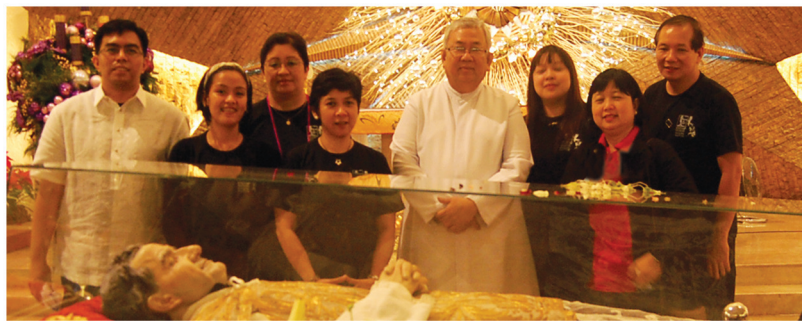
The Parish thanks the volunteers who coordinated, planned and smoothly organized this historic Parish event.