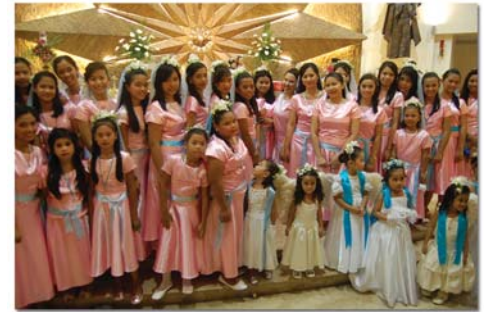
Floristas during the Grand Alay last May 26, 2012

On May 20, 2012, SJB Parish joined in the world-wide celebration of the 46 th World Communications Day which was instituted by Blessed John Paul II to be celebrated on Ascension Sunday. This year WCD 2012 activities in SJB included a short skit by the Youth Ministry on the value of personal communication, the showing of a video on the Ascension of Jesus before Masses and prayers for social communications media practitioners who are helping in the Church's mission.