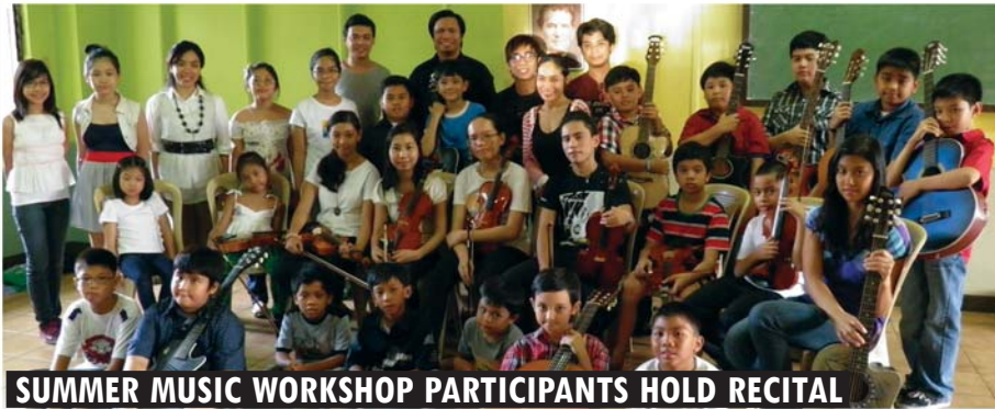
SUMMER MUSIC WORKSHOP PARTICIPANTS HOLD RECITAL