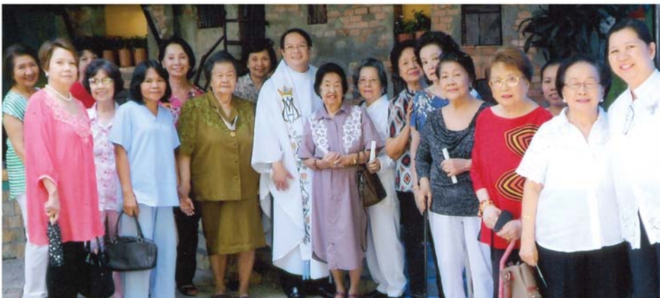
SJB ARCHCON CELEBRATES SOLEMNITY OF MARY HELP OF CHRISTIANS