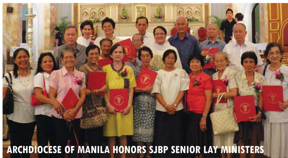
ARCHDIOCESE OF MANILA HONORS SJBP SENIOR LAY MINISTERS

4 An assignment to a community or work given by the (Salesian) Provincial.