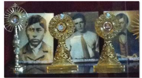
Reliquaries at the Mary Help of Christians Chapel